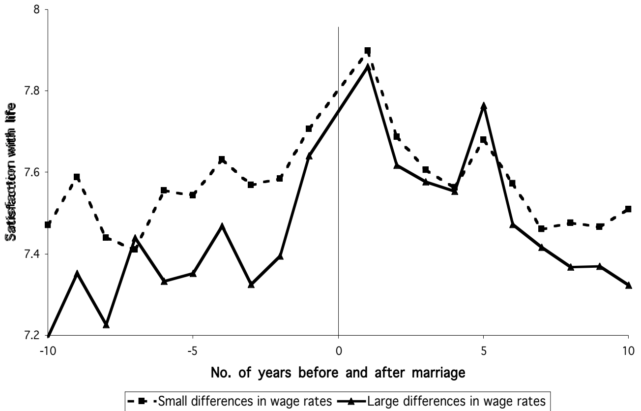
Figure 2: DIFFERENCES IN THE (SHADOW) WAGE RATE BETWEEN SPOUSES AND ITS EFFECT ON LIFE SATISFACTION AROUND MARRIAGE

Note: The graph represents the pattern of well-being after taking respondents' sex, age, parenthood, household size, relation to the head of the household, labor market status, place of residence and citizenship into account. Data source: GSOEP.