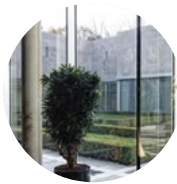
Tilburg University Founded 1927; > 20,000 students