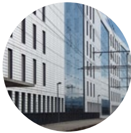
University of Basel Founded 1460; > 13,000 students

Faculty of Business and Economics, University of Basel and TIAS School for Business and Society, Tilburg University