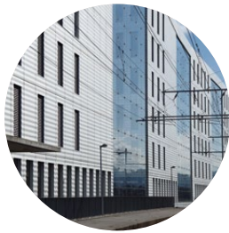
University of Basel Founded 1460; > 13,000 students

Faculty of Business and Economics, University of Basel and TIAS School for Business and Society, Tilburg University