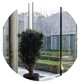
Tilburg University Founded 1927; > 20,000 students