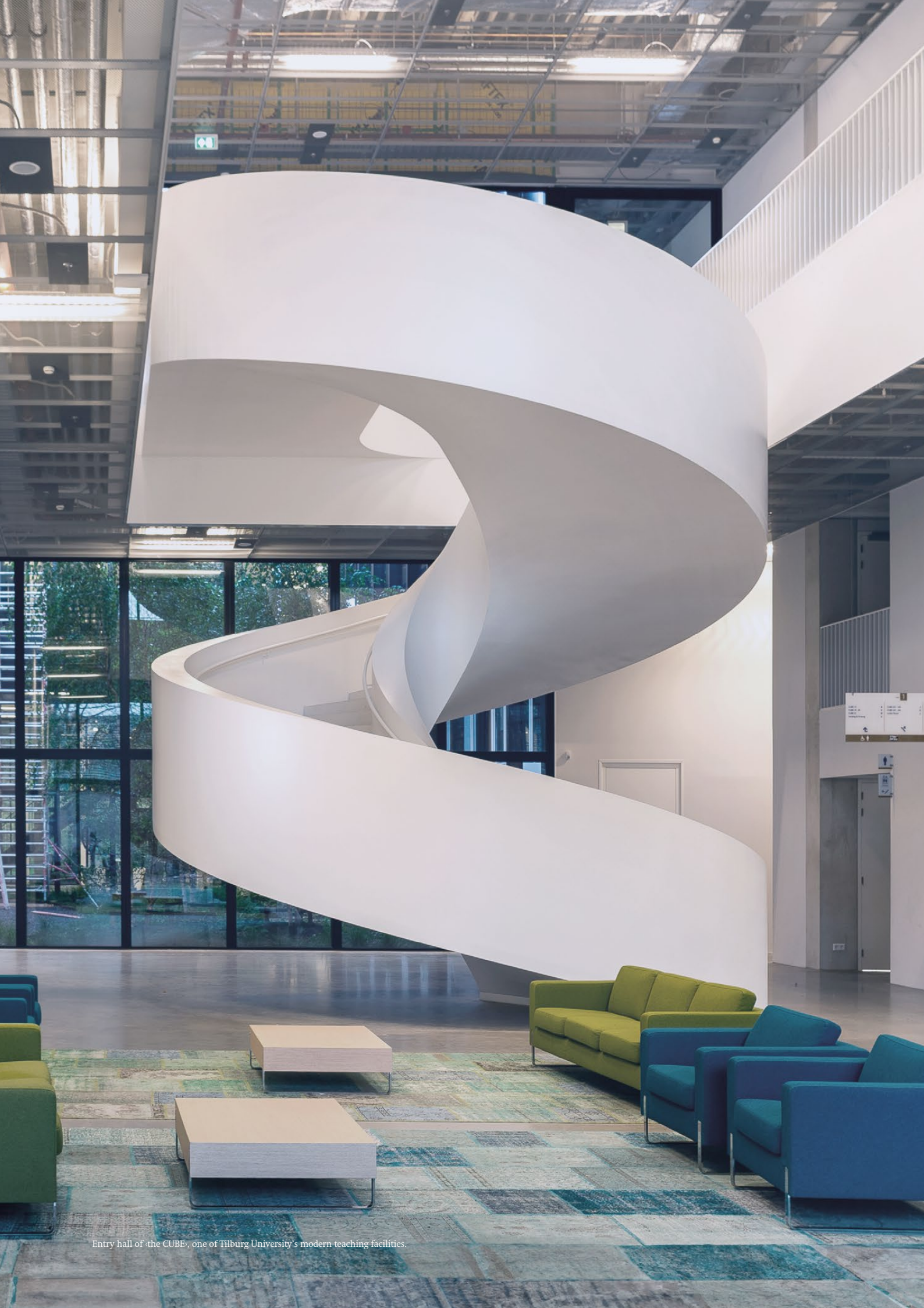
Entry hall of the CUBE, one of Tilburg University's modern teaching facilities.